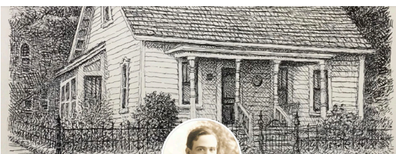
Edgar Lee Masters Memorial Museum

And, you can now join or renew your Friends membership and make donations online directly from the website. It's quick, easy and safe!!